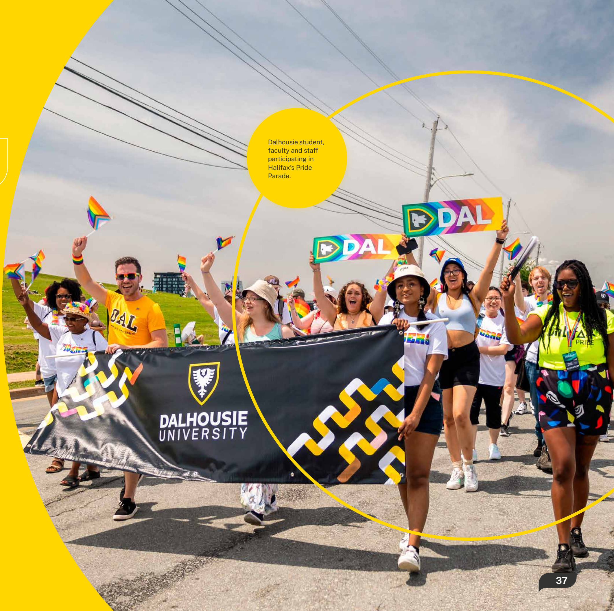
Dalhousie student, faculty and staff participating in Halifax's Pride Parade.