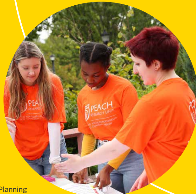
School of Planning students in the Planning for Equity, Accessibility and Community Health (PEACH) Research Unit discovering ways to build more vibrant communities.

We look at everything we do through a global lens. Whether it's launching a new community clinic, developing innovative student support programming or creating clean water solutions, we always ask ourselves, "How can this have an impact globally?" Being globally minded is part of our character at Dalhousie.