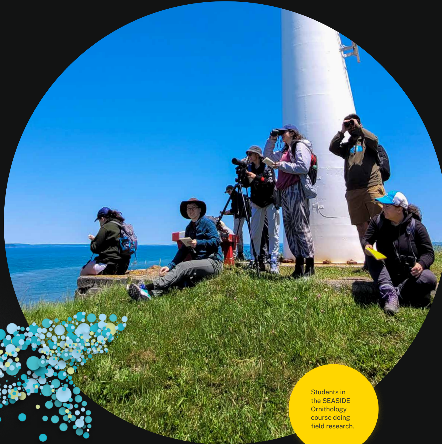
Students in the SEASIDE Ornithology course doing field research.

Dalhousie's Transforming Climate Action plan builds on the fact that the ocean absorbs approximately 20 times more carbon than all the trees on the planet. It aims to better understand the ocean's carbon-absorbing superpower, model it and then find ways to increase it. Taking a truly holistic and interdisciplinary approach, the plan also includes actions aimed at helping maritime communities and industries make the adaptations needed to live and work sustainably with the ocean.