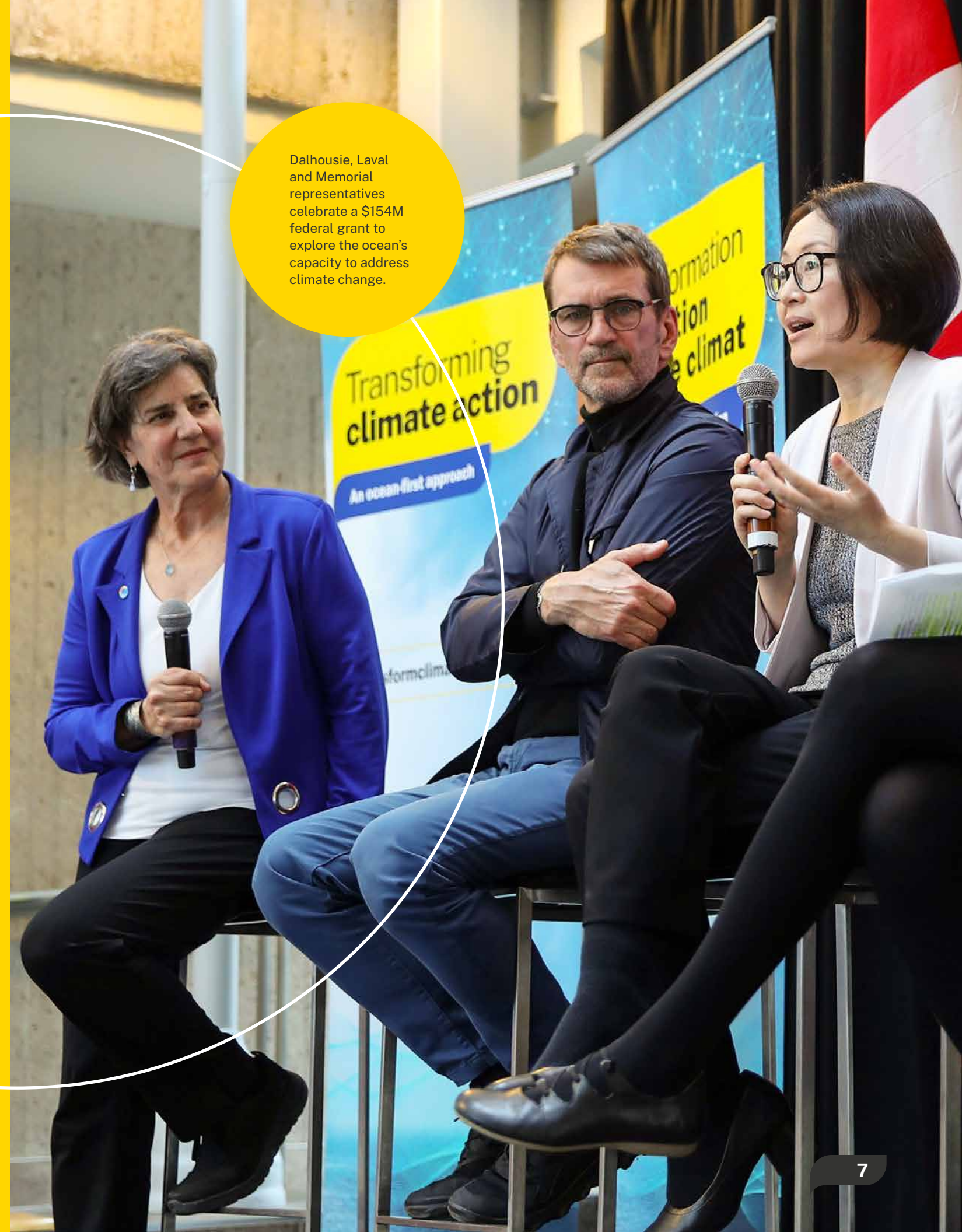
Dalhousie, Laval and Memorial representatives celebrate a $154M federal grant to explore the ocean's capacity to address climate change.